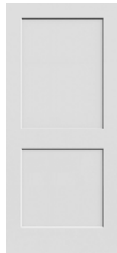
2-PANEL SHAKER FP-782