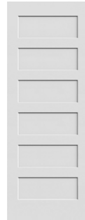
6-PANEL (8/0 TALL ONLY)