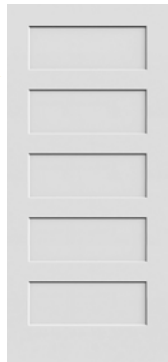
5-PANEL SHAKER FP-755