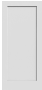
1-PANEL SHAKER FP-720