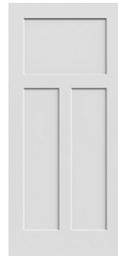
CRAFTSMAN SHAKER FP-760