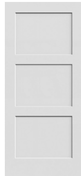
3-PANEL SHAKER FP-730